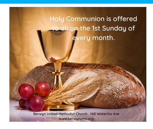
Sunday, Nov 6, 2022 10am